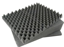
1501 3 pc. Replacement Foam Set