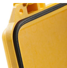
1503 Replacement O-ring