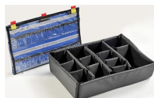
1505EMS EMS Accessory Set (Lid Organizer and Divider Set)