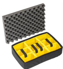
1505 Padded Divider Set