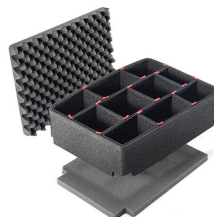
1560TPKIT TrekPak Case Divider Kit