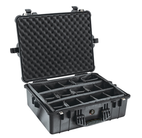
1604 With Padded Dividers