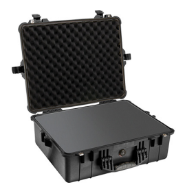
1600WF With Foam